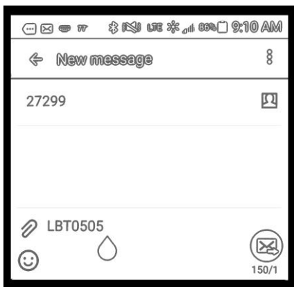
IMAGE: How to text LBT for next bus times

Long Beach Transit is in the early stages of developing a brand new website and a transit travel planning mobile application. In fall 2016, the transit agency will also introduce a 10-bus fleet of zero-emission battery electric buses – one of the largest fleets of this type in the country.